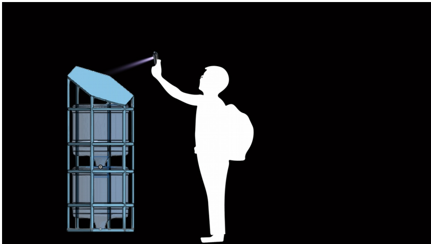
Interaction with one of the three pillars with phone Flashlight

Man-high pillars will invite visitors to add energy to the pillar via the flash-light of their mobile phone. With a jolt, the energy in the pillar will be released, joining the overhead fray with new patterns emerging from the visitor's interactions. In this way, visitors experience being the source and the shapers of the message, as their flashlights add to the constant light ripples, merging and collapsing with the waves created by other visitors, creating a unified message].