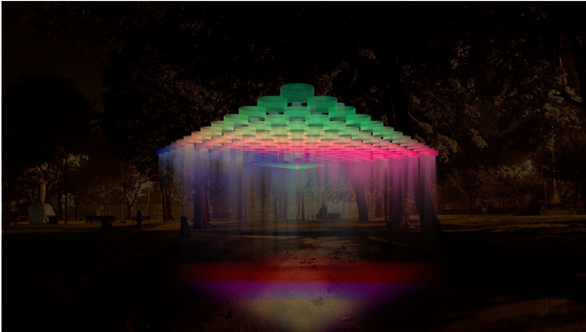
Impression of the installation from afar, the overhead lights and ground reflections.

The waves and fizzing of the medium, the movement of light waves, embrace the addition of multiple creative forces, shaping a new medium, a new message, which continuous re-creates itself. This work transforms visitors into the carriers of the message.