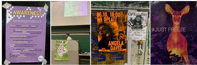
Awareness, Citizen Kino, Activism & Art in Berlin