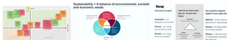
SDIA Workshop Results and Slides