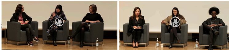
Two panel discussions at Bits und Bäume